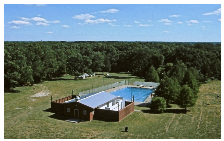
Check out Page Three for details on the progress of this major campaign to ensure the CE pool is available for generations to come.