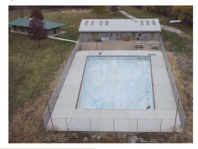
Dedicated to the Enhancement of the Camp Eastman Experience